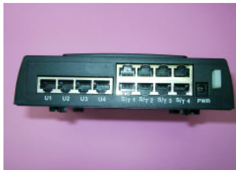
Figure 2. Power and Interface Connectors

Figure 2 shows the power and interface connectors at the rear panel of NT512.