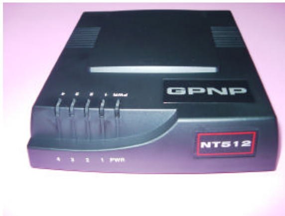
Figure 1. GPNP Inc NT512.